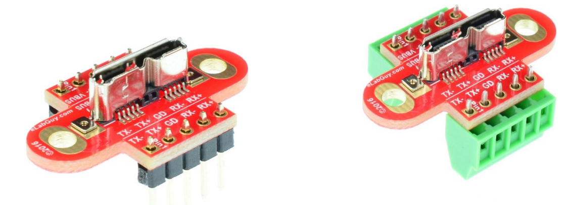
Figure 3: USB3u-BF-BO-V1AV Various connections